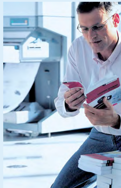
Graphic Arts Systems