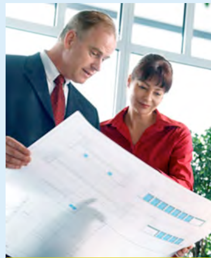
Technical Document Systems